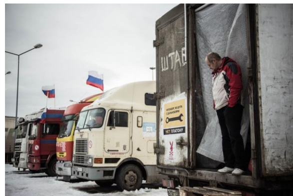
Russian truckers protest in St. Petersburg

Meanwhile, as the price of oil and the value of the ruble have plummeted, economic woes are fueling other protests. A new freight tax that would benefit Putin-allied oligarchs drove truckers to plan a nationwide protest including the blockade of highways – a remarkable move from a conservative constituency that had traditionally been part of Putin’s base of support. “The authorities want to take everything from us,” one trucker said. “They want to take our hard-earned money to line their own pockets.” 25 Days before the protests were set to begin, the government announced a freeze on the tax hike. 26 However, ordinary Russians’ economic struggles have fueled growing discontent, and it is clear that while the movement against Putin may evolve, it is sure to continue. 27