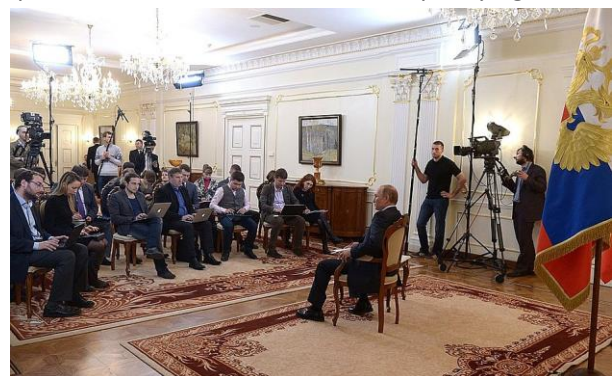
Vladimir Putin addresses a press conference

since the invasion of Ukraine, state media portrays Russia as the target of a Western conspiracy to "eliminat[e]...the Russian people as an entity in world history" and attacks dissidents as American agents – a "fifth column" of "national traitors." 42 With 94