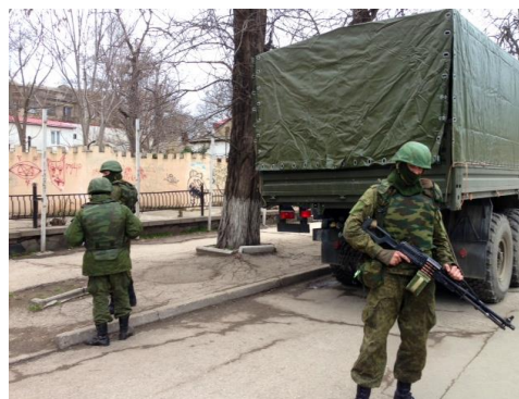
Unmarked soldiers in the Crimean capital, Simferopol

More recently, activists have thrown themselves into battle with Putin's media machine after Russia's 2014 invasion of Ukraine and annexation of Crimea, as well as its military intervention in Syria on behalf of embattled president Bashar Al-Assad. They seek to counter Kremlin statements that Russian troops are not present in eastern Ukraine or on the ground in Syria. In order to bolster his fiction that any Russian soldiers in eastern Ukraine are there as volunteers, Putin has made military deaths in peacetime a state secret. Activists, however, are determined to reveal the truth. "We are part of an information war against our enemy, which happens to be [the Russian government]," one says. 18