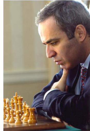
Garry Kasparov, dissident and former chess world champion

Garry Kasparov, a former chess world champion, headed The Other Russia, an anti-Putin coalition launched in 2006. One of Putin's fiercest opponents, he too fled Russia in 2013 in fear of arrest. Since, he has become known as "the sharpest critic of the Kremlin in the West," and he has also made headlines for his critique of the West's "political and moral capitulation" to Putin. 37 However, well-known names like Kasparov and Khodorkovsky are only one part of the movement against Putin. Despite