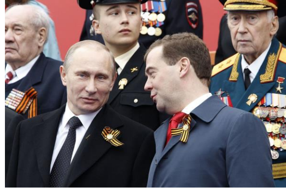
Vladimir Putin and Dmitry Medvedev

“I believe it would be only correct for the [United Russia party] congress to support the candidacy of Prime Minister Vladimir Putin for president of the Russian Federation,” Dmitry Medvedev announced. 1 It was September 2011, and Medvedev had been president of Russia for nearly four years – four years of rhetoric about reform, modernization, and even “genuine democracy.” 2 Now, however, no doubt