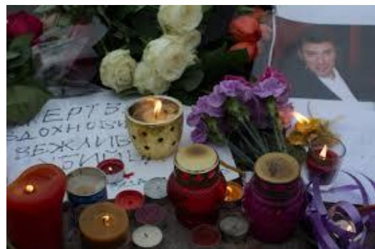
Candles, flowers, and messages left near the site of Boris Nemtsov's assassination

Imprisonment is not the only consequence of dissent. The independent journalist Anna Politkovskaya was shot to death in her apartment building in 2006; the next month, former Federal Security Service officer turned whistleblower Alexander Litvinenko died of poisoning in London. Three years later, human rights activist Natalia Estemirova was found dead in a car trunk, and whistleblower Sergei Magnitsky died in custody after a brutal beating. However, it was Boris Nemtsov's murder in 2014 that marked a turning point. "We have long been used to smear campaigns, criminal charges and even beatings, but this has taken things to a new level," one activist said. "We are all in a dark forest now, and anyone who opposes Putin is in danger." 46