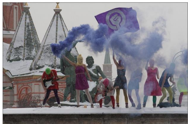
Pussy Riot protest in Red Square, Moscow

The struggle against Putin has reached beyond Russian borders as activists have worked to raise global awareness of Putin’s repression. For instance, the punk group Pussy Riot attracted international attention during their show trials and subsequent prison sentences for a February 2012 protest inside Moscow’s Cathedral of Christ the Savior, staged in opposition to Russian Orthodox Patriarch Kirill’s