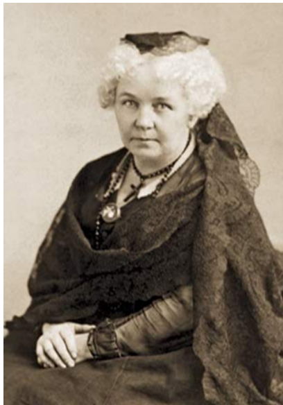
Elizabeth Cady Stanton

voiced women's demands in no uncertain terms, concluding that "because women do feel themselves aggrieved, oppressed, and fraudulently deprived of their most sacred rights, we insist that they have immediate admission to all the rights and privileges which belong to them as citizens of these United States." 5 In the words of one activist, despite years in which she "pined for that freedom of thought and action that was then denied to all womankind," it was the Seneca Falls meeting that "gave this feeling of unrest form and voice," leading her to act. 6 She was not alone. Within a few years, women's rights conventions were held regularly all over the country. Obtaining a woman's right to vote soon became the principal focus of the movement. Elizabeth Cady Stanton and Susan B. Anthony devoted the rest of their lives to the cause of women's suffrage. Despite the "self-evident" principles upon which women based their arguments, it ultimately took seven decades until all women had the right to vote.