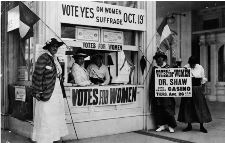
Suffragists campaigning for the right to vote in 1920, just before the amendment was ratified. ( Library of Congress ) https://www.thenation.com/article/august-26-1920-the-19-th-amendment-is-ratified-granting-women-the-vote/