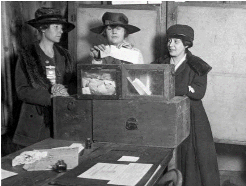
Women casting their votes in New York City, c. 1920s.

for all citizens to vote regardless of race, the definition of citizen was too narrow at the time to encompass more than white men. It was not until 1924 with the passage of the Snyder Act that Native Americans were classified as citizens and able to practice this right theoretically. Even then, it was not until 1947 that state barriers to Native American suffrage were lessened. In 1952, under the McCarran-Walter Act, individuals with Asian ancestry were granted the right to become citizens. Their pathways to citizenship had been blocked under previous legislation and court rulings, some dating back to the late 1800s: the Chinese Exclusion Act of 1882 denied Chinese individuals from applying for citizenship; the Supreme Court ruled in 1922 that those with Japanese heritage were unable to apply for naturalized citizenship; and, in 1923 the Court also ruled “Asian Indians” were prohibited from naturalizing. Until the Voting Rights Act of 1965, many social and economic barriers were in place to severely inhibit the ability of many black Americans, especially those in southern states from exercising their right to vote; some of these tactics included literacy tests, tax and other economic barriers, and physical intimidation at registration and voting places. While access to the vote swelled in the decades after the 19th Amendment was passed, social barriers remain in place.