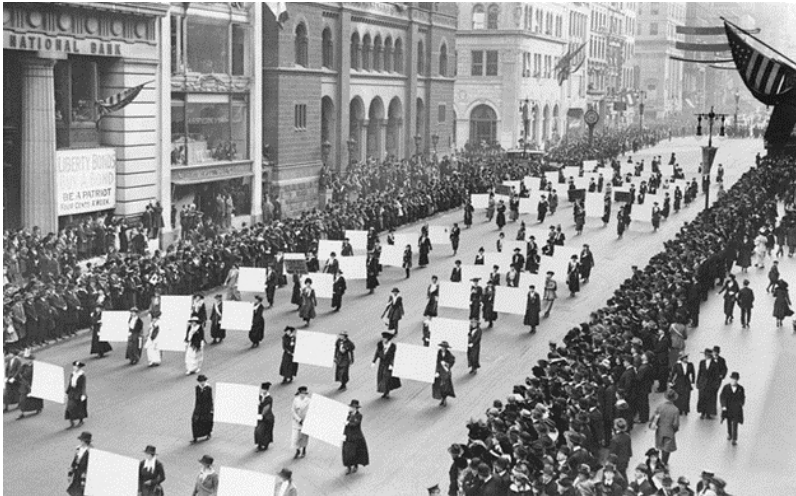
Women marching in suffrage parade, New York City, 1917.

even tested political boundaries. Stanton declared herself a candidate for U.S. Congress in 1866 to call attention to the legal anomaly that although she was barred from voting no law stopped her from running for office. In 1872, the author and activist Victoria Woodhull formed a political party and declared herself its candidate for president. In 1910, Alice Paul formed the Congressional Union for Women's Suffrage within the NAWSA to lobby members of Congress for a women's suffrage amendment. In 1916, Paul went on to found the National Women's Party.